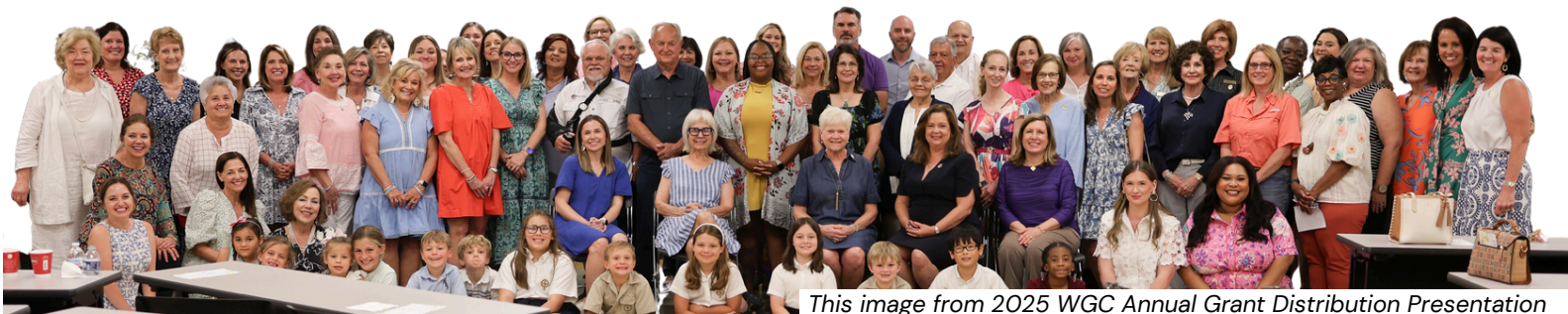
This image from 2025 WGC Annual Grant Distribution Presentation

"we can do small things with great love"