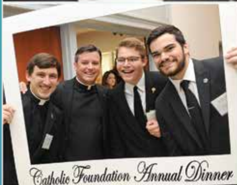
Catholic Foundation Annual Dinner